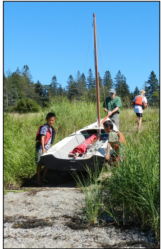
Just the right size.

Easy to build. Easy to move. Easy to get going. Easy on the wallet.